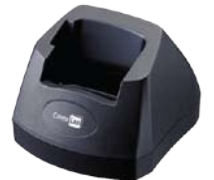
Charging & Communication Cradle