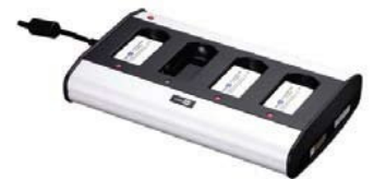
4-slot Battery Charger