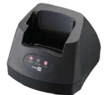
Modem Cradle Ethernet Cradle