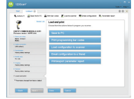
123SCAN 2 Utility screenshot

Our 123Scan 2 configuration utility is loaded with time-saving features that reduce the cost of deploying and managing Motorola scanners. An easy-to-use graphical user interface and a patented wizard tool enable effortless electronic staging in record time. Automatically detect and establish two-way communication with all your scanners, without scanning a bar code — an industry first. Another industry first lets you update firmware without losing existing settings; 123Scan 2 automatically reloads pre-upgrade settings upon completion of a firmware upgrade. To learn more, please visit www.motorolasolutions.com/123scan2