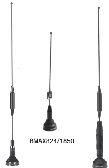
(B)MAXSCAN1000 BMAX824/1850 BMAX8155S