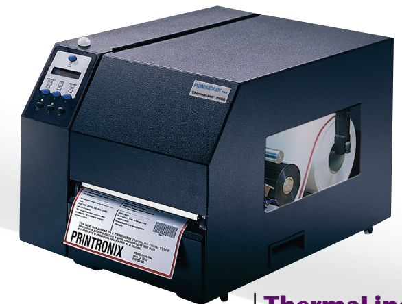
ThermaLine T 5208/T 5308