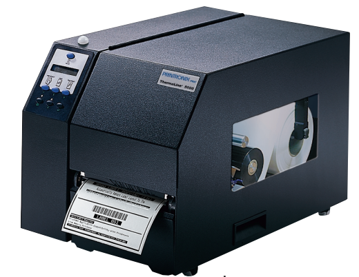
ThermaLine T 5206/T 5306