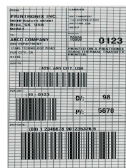
Full Overstrike Example

The upgraded T6000e with ODV-2D allows users to print and encode RFID labels and inspect and grade the quality of printed barcodes in a single pass. Now, one printer can now do the work of multiple devices to create a new level of productivity and cost savings. No longer are two separate machines needed to perform two completely different functions. This is a unique function not available on any other printer currently on the market.