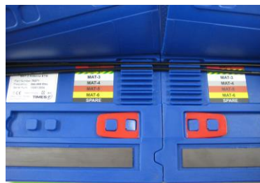
Integrated cable channels & Inter-connecting straps