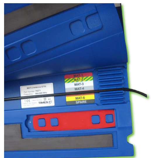
Integrated cable channels – Cable detail

Event and race-proven, the SlimLine RTAS has been extensively stress and performance-tested in hundreds of events around the world, putting this complete race timing antenna system in a class of its own.