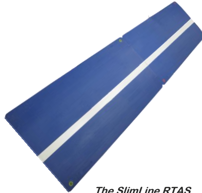
The SlimLine RTAS

Complete race timing antenna system – for deployments of up to 7 antennas